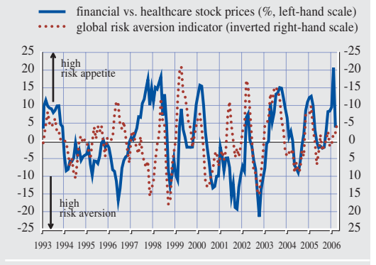
Chart B9.2 Six-month changes in the euro area financial vis-à-vis healthcare stock prices and in the global risk aversion indicator

Sources: Merrill Lynch, Thomson Financial Datastream and ECB calculations.