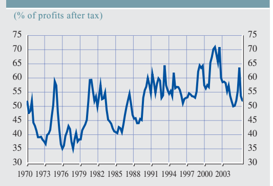
Chart Bl.2 Net dividends paid out by US corporations

Note: Profits include inventory valuation and capital consumption adjustments.